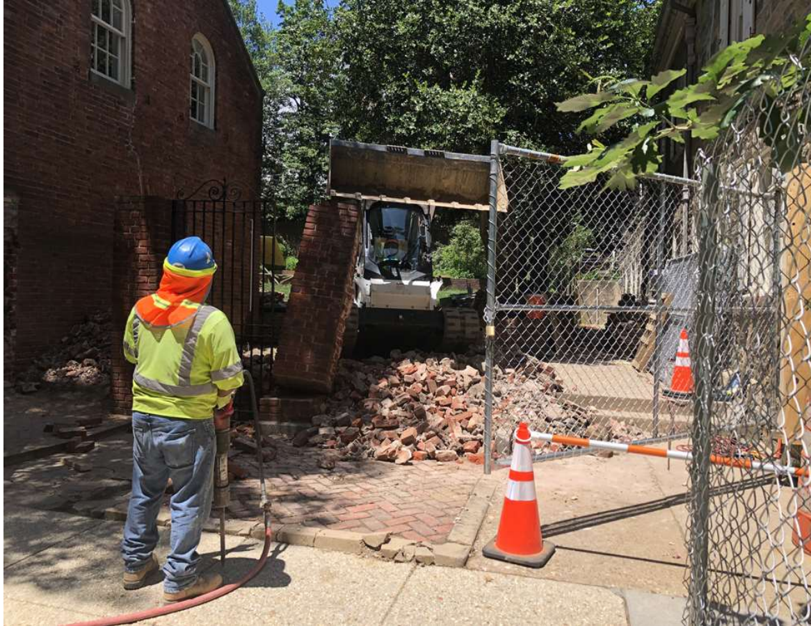
Still handicapped by lack of public space permit.