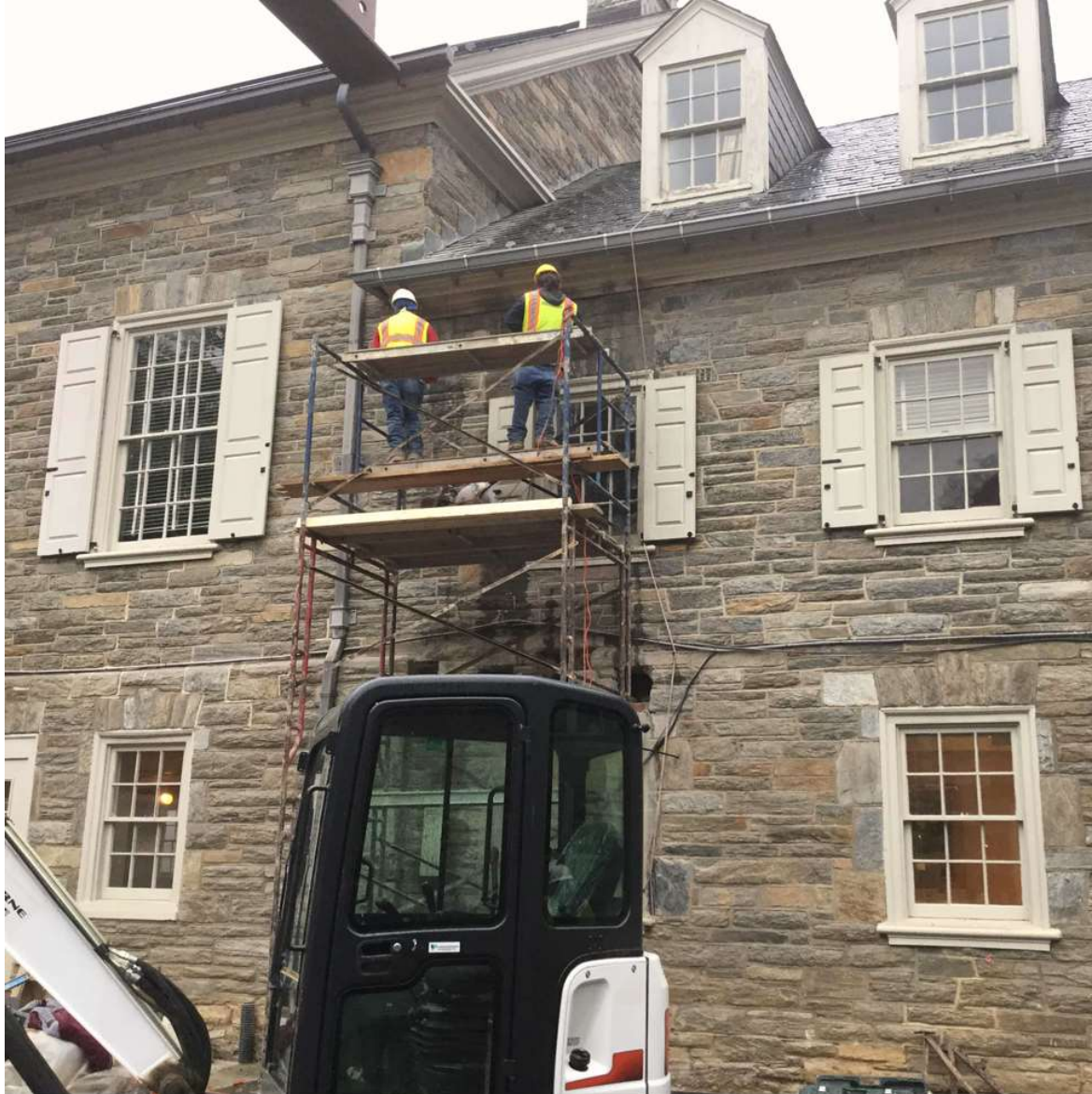
The Meeting House wall is soon filled with holes (beam pockets).

Meanwhile, the masons, frustrated in their plan to build something today, suddenly erect siege engines and attack the Meeting House with weapons of mass destruction.