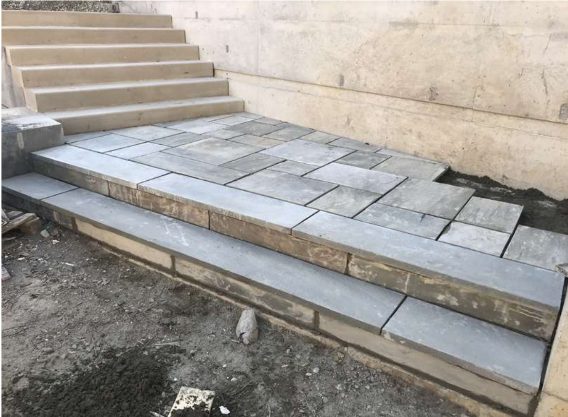
Masons add bluestone to the garden stair landing.