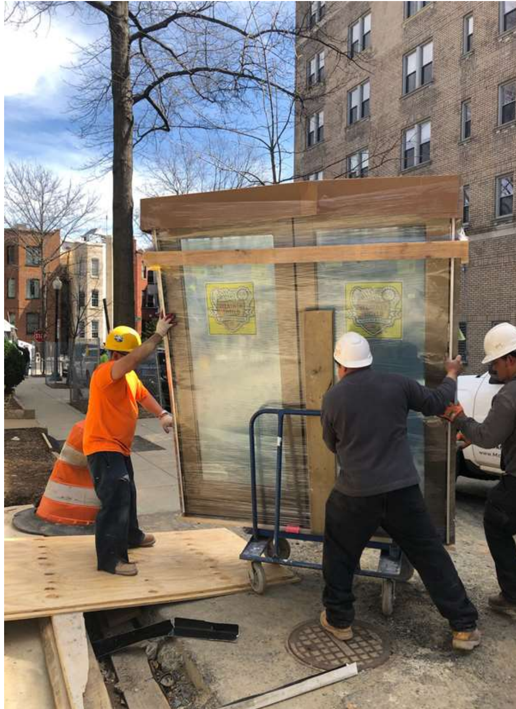
Including some Quaker House patio doors.