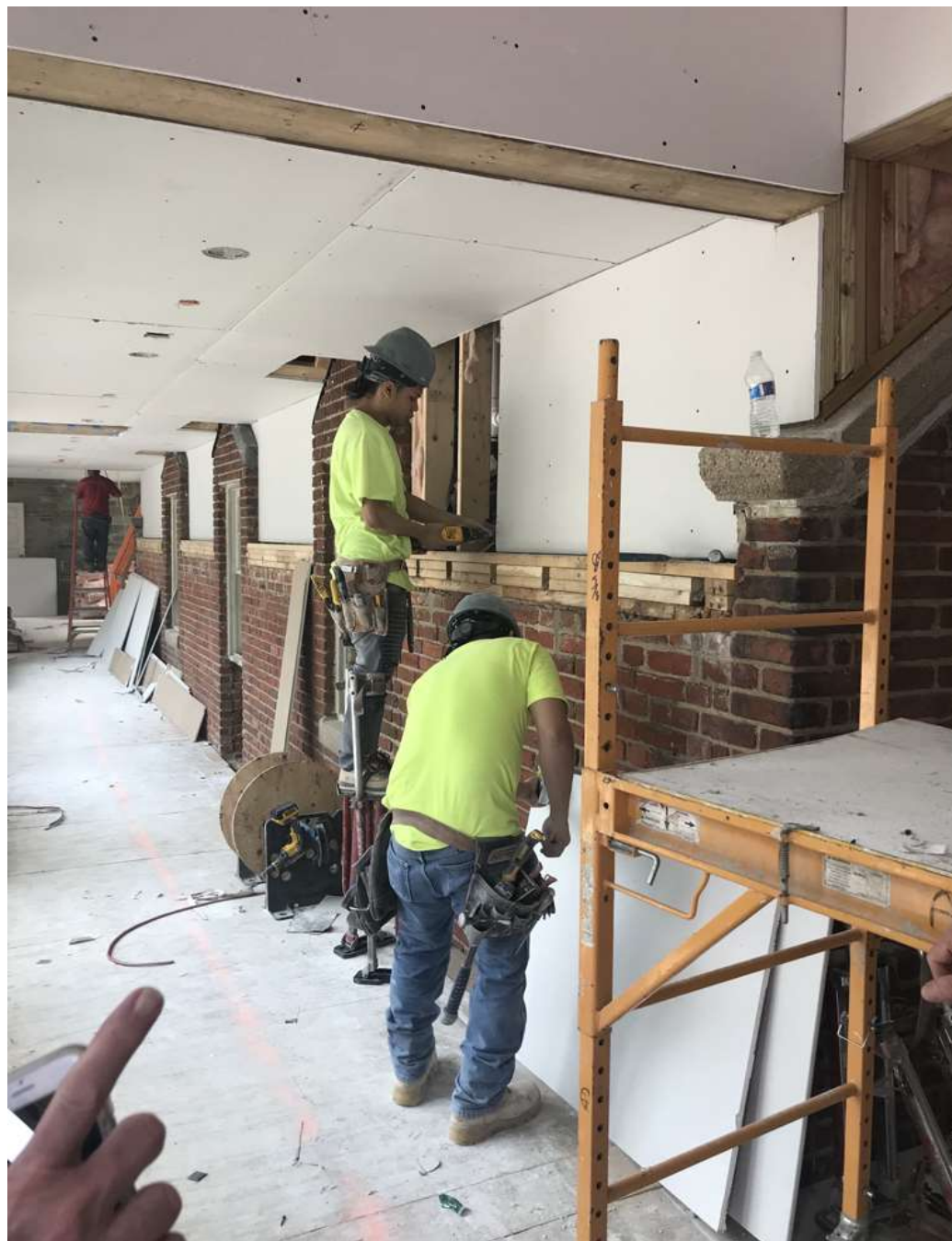
In the corridors.