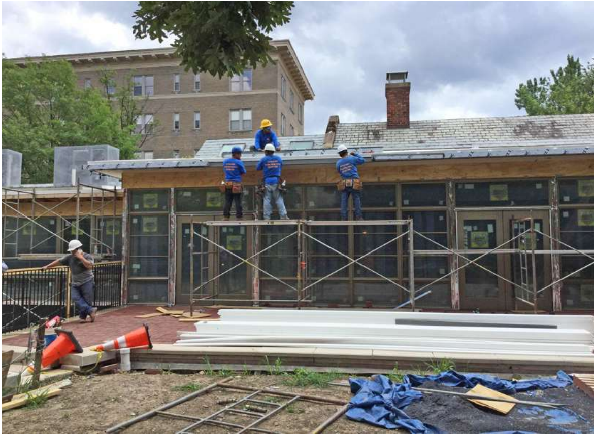
Six roofers install fascia and gutters on the new Quaker House upper corridor.