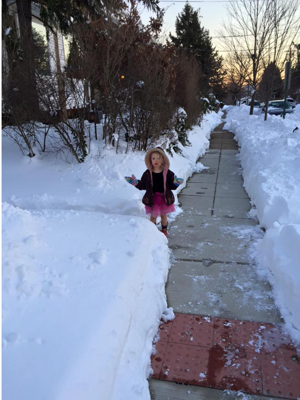
Osa, with tutu