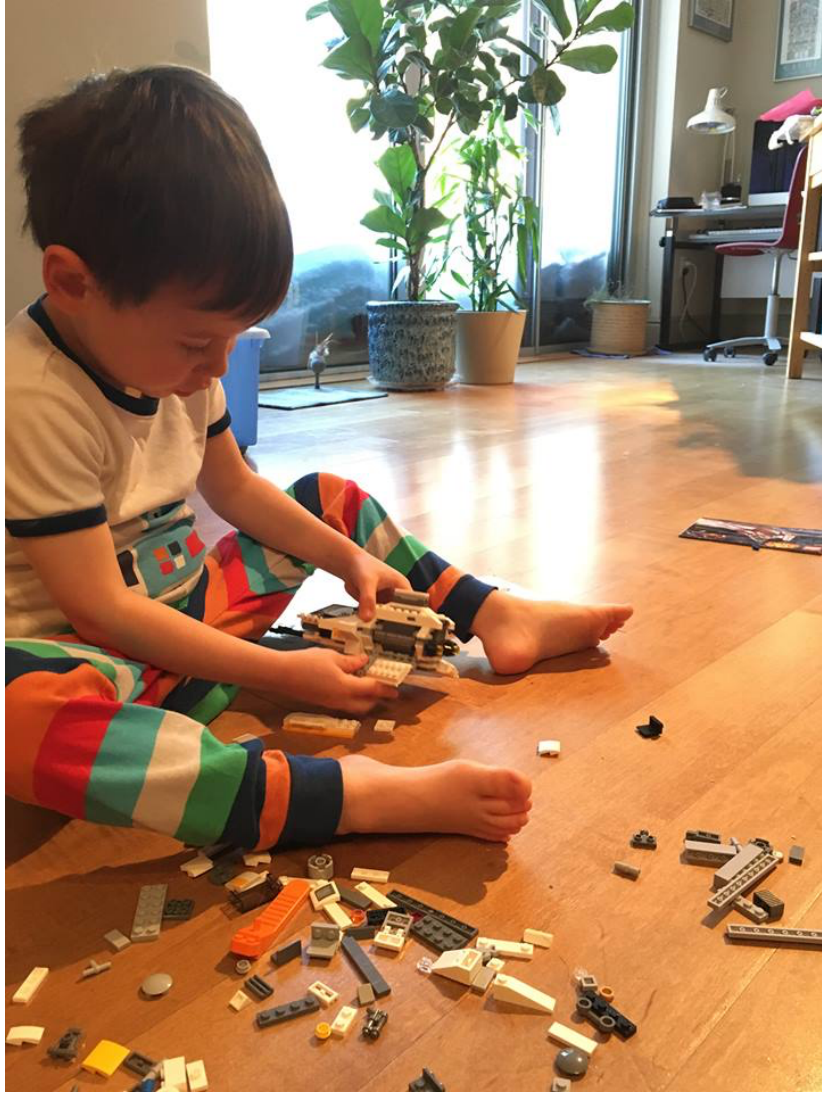
Isa, with Legos