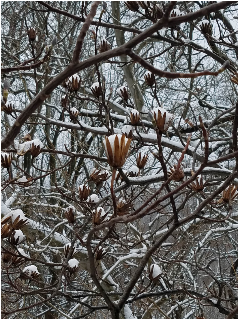
Nor'easter DC Style, February 1, 2021