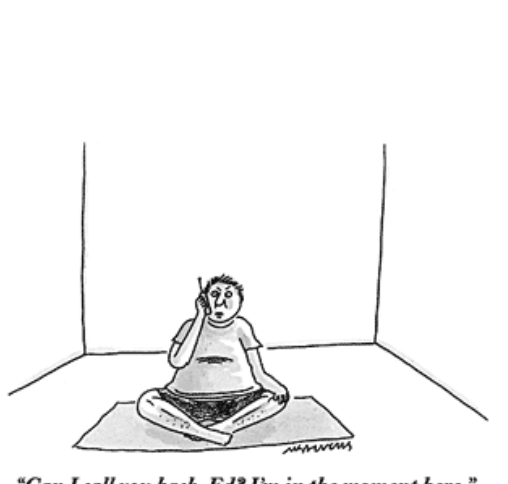
"Can I call you back, Ed? I'm in the moment here."