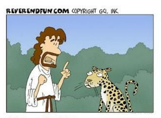
LEPERS ... I HEAL LEPERS

© 2015, Friends Meeting of Washington, DC website by \underline{\text{Vonn New}}